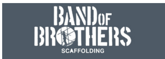
Band of Brothers